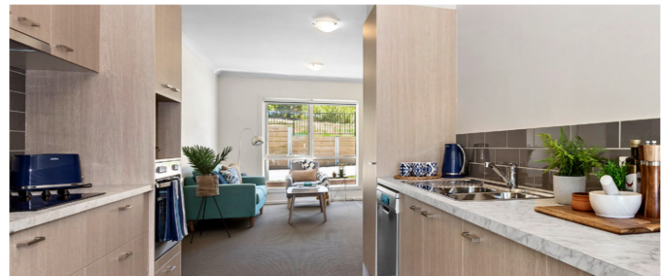
Left: bedroom in Wattle unit. Above: view of lounge room through kitchen in Wattle unit.

Live at Golden Rise and discover a new home, caring community and a whole new outlook on life.