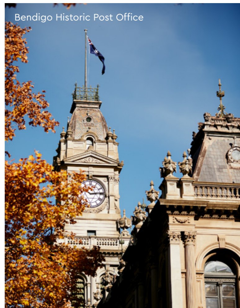
Bendigo Historic Post Office